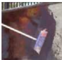
Broom on 3 coats of BBSM