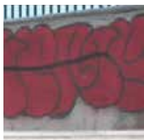
Red spray can bubble writing

TIP 2 If you are fixing someone else's former failure and may be having problems, then BBSM can be left overnight