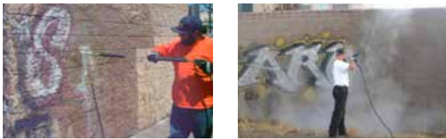
Though cold water pressure washers will usually suffice, hot water yields the best results.

Do not use 'turbo' type nozzles, or blast too close, as you may cause damage and will possibly only remove a small percentage more.