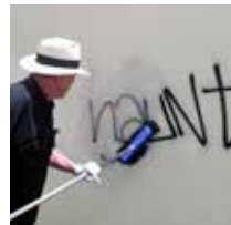
Broom on BBSM, rinse off with cold water