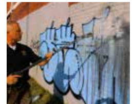
Rinsing larger graffiti after applying BBSM