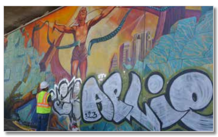
'Hitting the Wall' © Judy Baca (Los Angeles 110 Freeway)