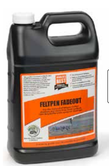
1 Quart: Item WB0032 1 Gallon: Item WB0030 5 Gallon: Item WB0031

Alternative uses include removal of eggs on signs and 'dusties' (which are caused by taggers pushing in grease and grime into painted walls). Water down 20:1 for general building wash down and organic stain removal from plants/algae and mold.