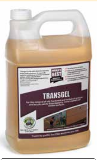
1 Gallon: Item WB0050

1 gallon will remove up to approx.150 - 200 sq ft.