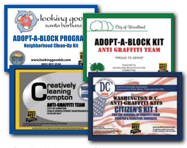
(Available in cases of 12. Custom Labeling available upon request).