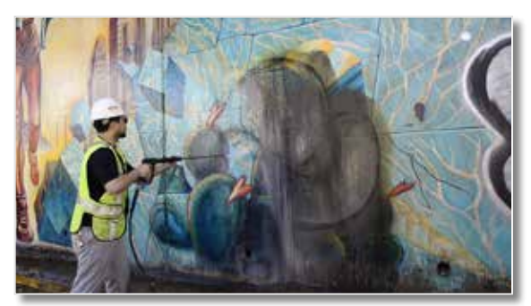
Cleaning graffiti after using Muralshield in conjunction with World's Best Graffiti Coating