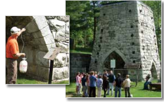
Friends of Beckley Furnace apply World's Best Graffiti Coating.

World's Best Graffiti Coating works in conjunction with MuralShield by offering long lasting protection for murals and artworks. See data sheet for further details.