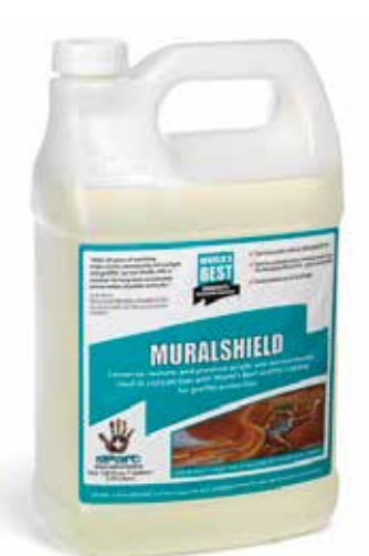
1 Gallon: Item WB0130 5 Gallon: Item WB0131

Coverage is approx. 400-600 sq ft per gallon. See data sheet for further details