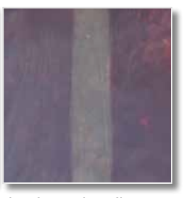
Feltpen Fadeout removes red spraycan stains from virtually any building surfaces, after or during removal using BBSM Graffiti Remover.