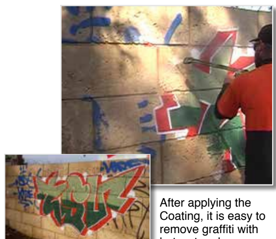
Coating, it is easy to remove graffiti with hot water alone, or with just one quick application of our removers.