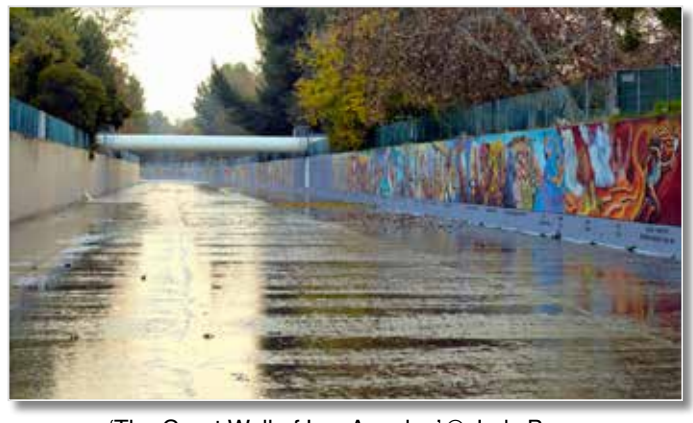
'The Great Wall of Los Angeles' © Judy Baca (the world's longest mural)