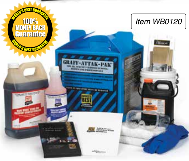
IDEAL FOR CITIES, SCHOOLS, FACILITIES, GROUNDS MAINTENANCE, DIY PROPERTY OWNERS & CONTRACTORS.