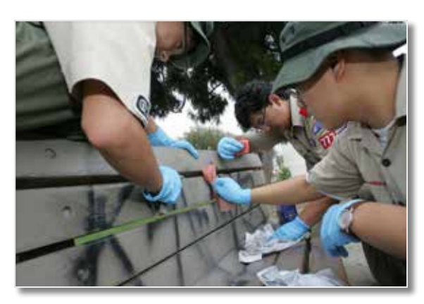
THE IDEAL GIVEAWAY FOR VOLUNTEER CLEAN-UP EVENTS

(Graffiti 'Afterwipes' are a handy substitute for a damp towelling cloth. Ideal for wiping down surfaces and hands).