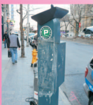
Poster tape & glue removal