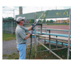
Sports Field benches